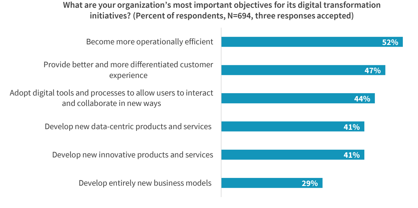
Figure 1. Operational Efficiency is the Most Common Objective of Digital Transformation

Digital transformation is a critical goal for most organizations, with 72% of organizations reporting that they have implemented or begun to implement digital transformation initiatives. Successful initiatives result in IT service provisioning agility, which in turn supports and enables modern business agility. As IT organizations attempt to deliver a cloud-like experience for internal and external services with infrastructure, software, and services that power businesses from the core to edge, it is critical that they modernize not only the technologies and services that power their applications and operations but also existing business processes and workflows. Doing so will help them to avoid business bottlenecks and roadblocks during critical execution events like procurement, deployment, scaling, and reallocation of IT resources. It is no surprise that, according to ESG research, respondents' most cited objective for their digital transformation initiatives is to become more operationally efficient.<sup>2</sup>